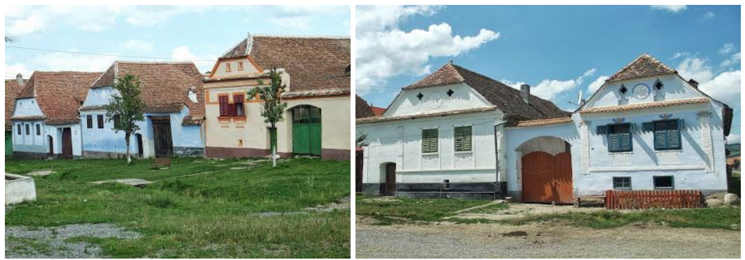
Figure 1. Saxon houses from Viscri

"The saxon villages display a remarkable, unspoilt harmony between people and landscape. The steeply rolling topography has defined the pattern of development in each village, from the linear street pattern in Viscri to the trifurcate pattern in Roades. The valley systems in which Roades and Crit have been built allow for a central village 'square', whereas the single valleys in Viscri, Floresti and Mesendorf have led to a main street with subsidiary cross-streets. These villages are enclosed and neatly protected by steep valley sides. Where landform is less steep, development follows a looser pattern, as seen in Roandola and Laslea." (http://www.mihaieminescutrust.org)